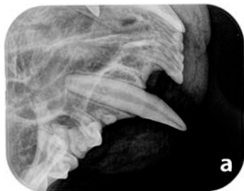
Lateral Bisecting Angle 104