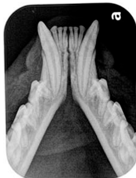
Occlusal Bisecting Angle 404, 403, 402, 401, 301, 302, 303, 304