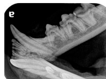
Lateral Bisecting Angle 304