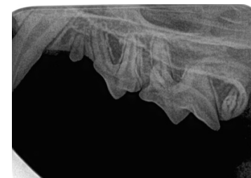
Lateral Near Parallel Technique 206, 207, 208, 209