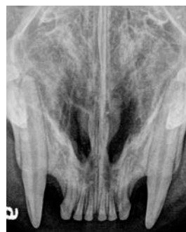
Occlusal Bisecting Angle 104, 103, 102, 101, 201, 202, 203, 204