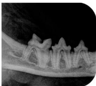
Lateral Parallel Technique 409, 408, 407