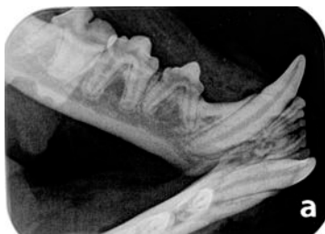
Lateral Bisecting Angle 404