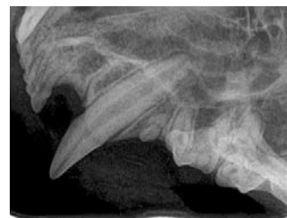
Lateral Bisecting Angle 204